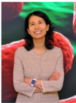
Chief Public Health Officer Dr. Theresa Tam