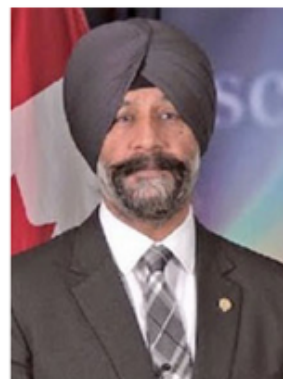
Associate Deputy Minister