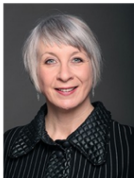
Minister of Health The Honourable Patty Hajdu

Meet the Public Health Agency of Canada's leaders.