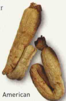
American ginseng root